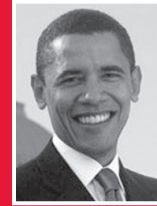
Barack Obama U.S. Senator Democrat