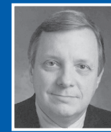
Dick Durbin U.S. Senator Democrat